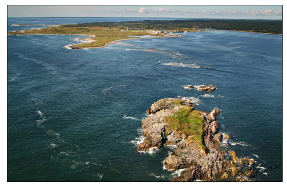
Battery Island with the Fortress Site in the background, shot from around 500 feet up.